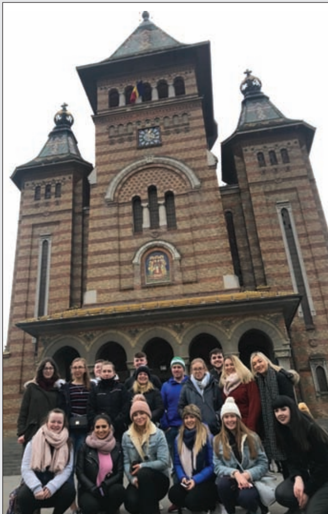
Group in Timisoara.