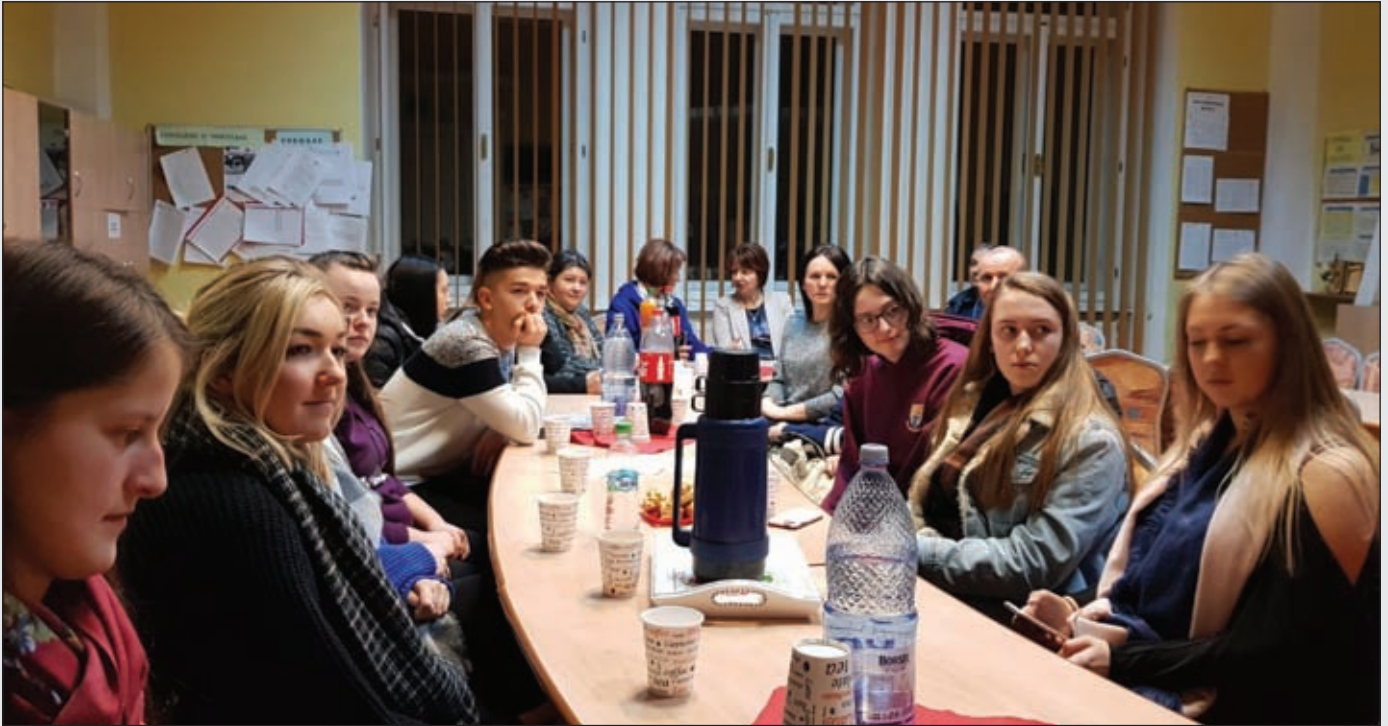
Group in Orastie at induction.