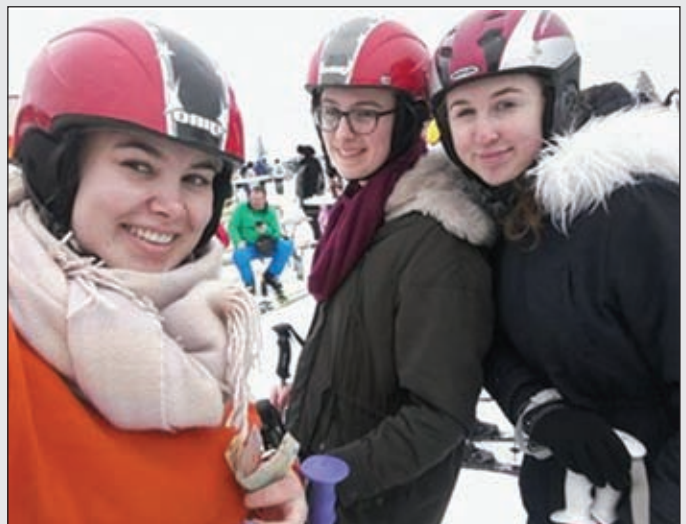
Students enjoying skiing weekend.