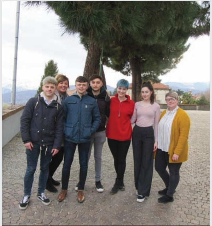
Group photo in Pinerolo.